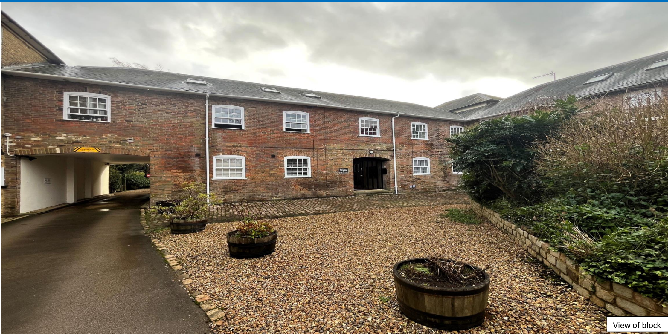
View of block